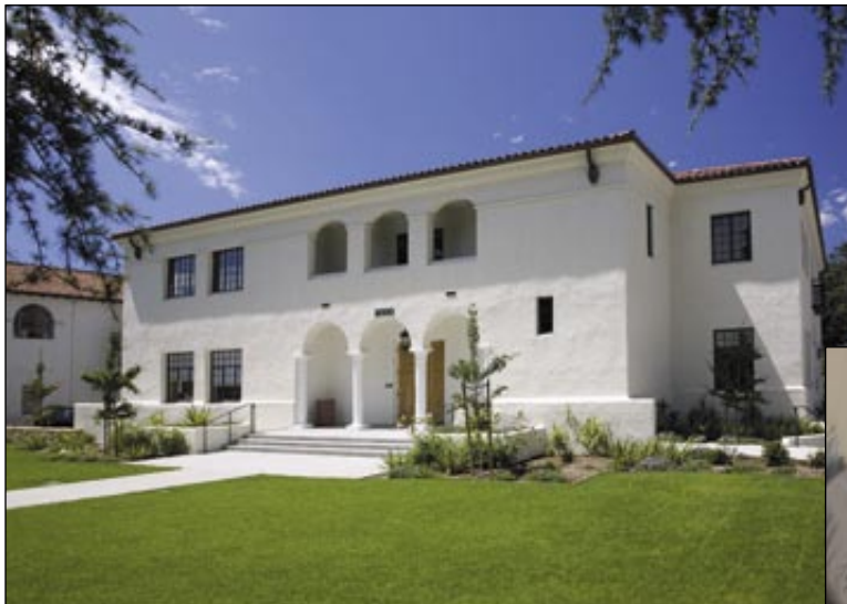
Historic Restoration: Riviera Park Research & Communications Center at 2020 Alameda Padre Serra