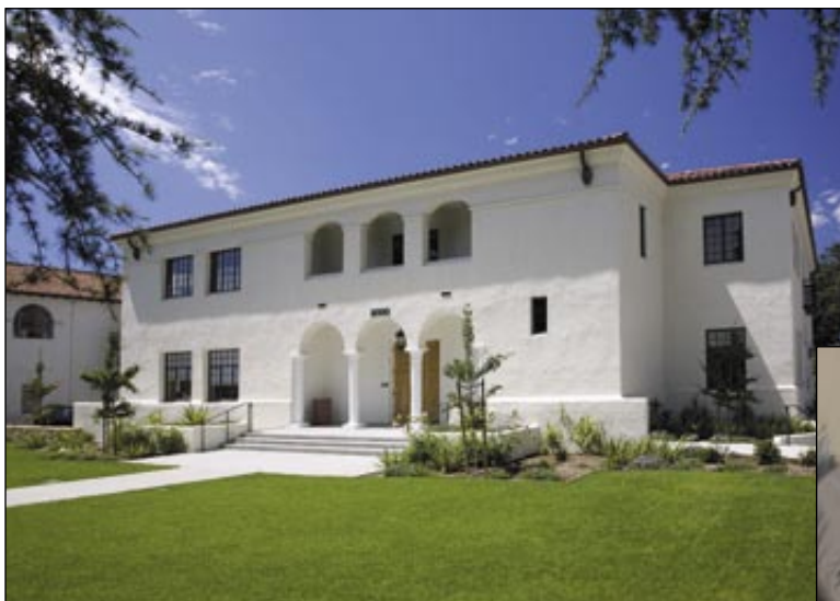
Historic Restoration: Riviera Park Research & Communications Center at 2020 Alameda Padre Serra