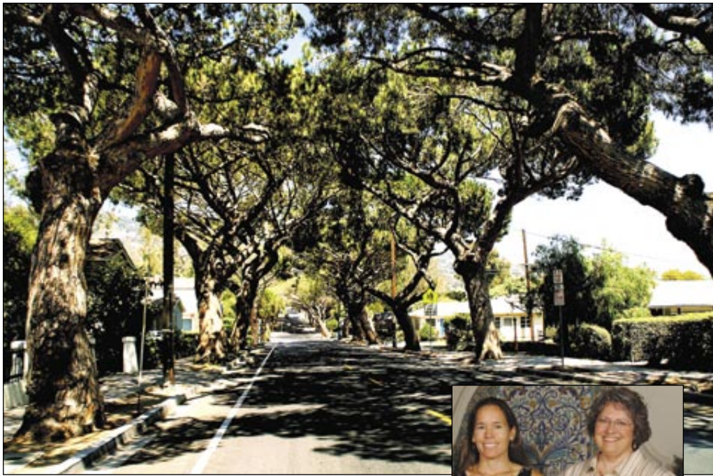
Architectural or Natural Feature: Italian Stone Pines at East Anapamu Street Property Owner: City of Santa Barbara; Landscape Maintenance: City of Santa Barbara Parks & Recreation Department