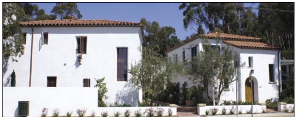
Multiple Dwellings: Paseo Bonito at 727-743 East Anapamu Street