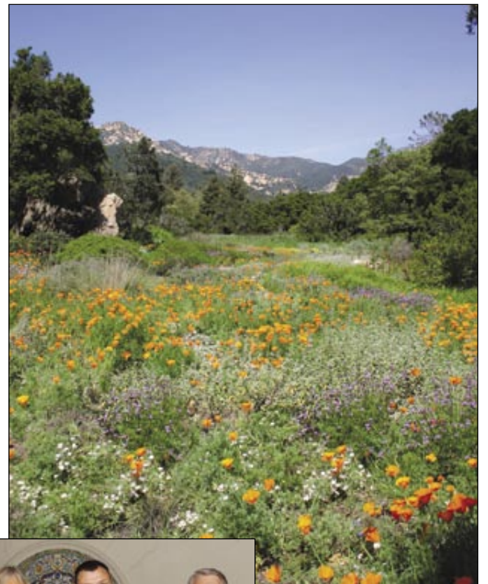
Open Public Space: Santa Barbara Botanic Garden at 1212 Mission Canyon Road Property Owner: Santa Barbara Botanic Garden Landscape Architecture & Maintenance: Santa Barbara Botanic Garden