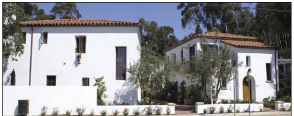
Multiple Dwellings: Paseo Bonito at 727-743 East Anapamu Street