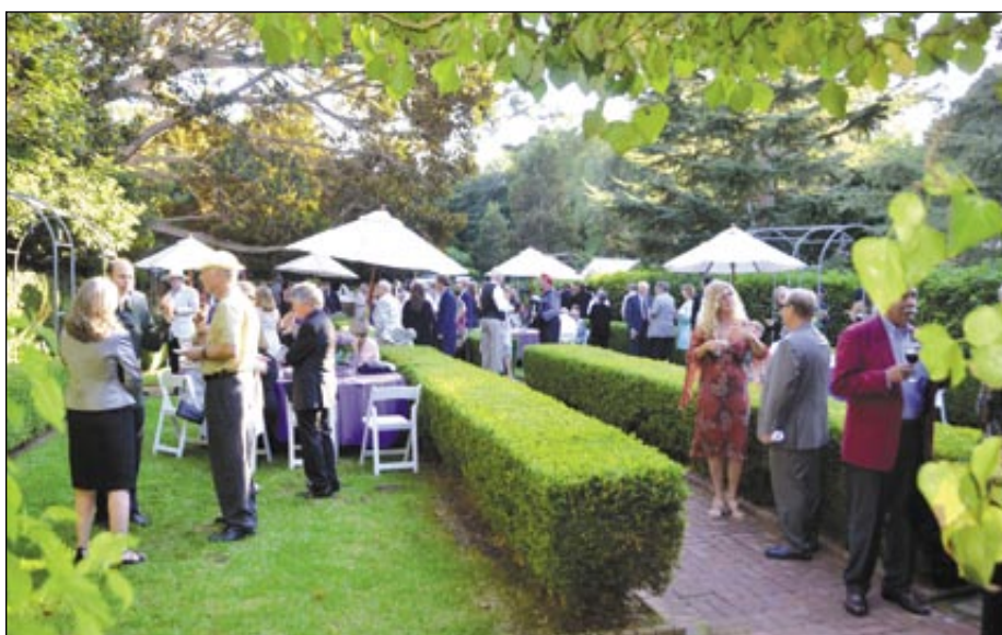
A Garden Reception preceded the Awards Ceremony at the Music Academy of the West, Hahn Hall