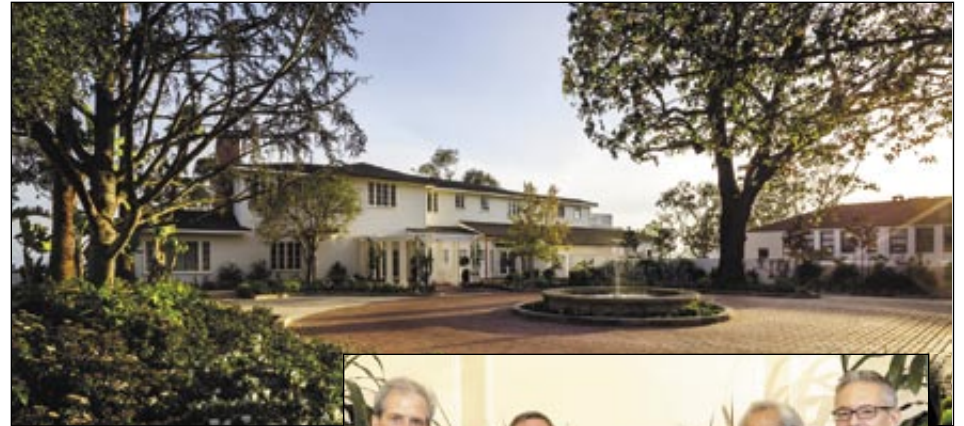
The President’s Award – El Encanto Santa Barbara 800 Alvarado Place