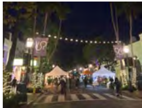
Downtown Promenade Holiday Market Lighting & Store-Front Art Installations Read More...