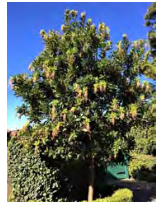
Most popular on SBB Website: Marina Strawberry Tree (Arbutus 'Marina') Read More...