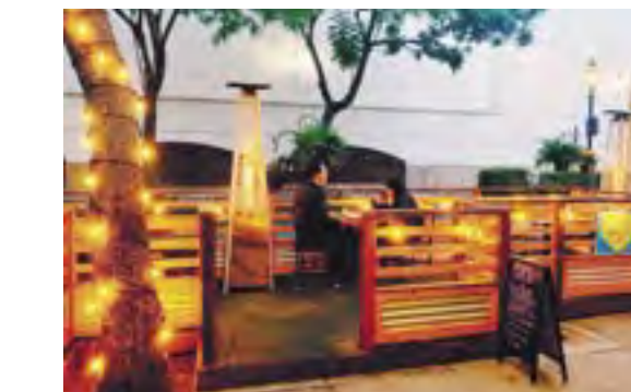
"Locals Helping Locals" Top: Brass Bear Brewing & Bistro Bottom: Little Kitchen