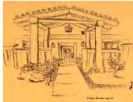
Kids Draw Architecture Calendar Read More...