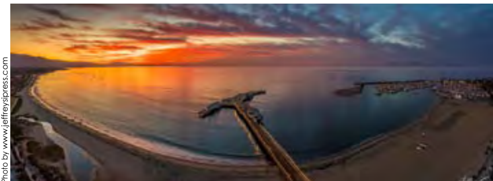
Let's Hear From You! ~ "What Is Beautiful To You?" Share with us "What is Beautiful To You?" by sending an email to info@sbbeautiful.org