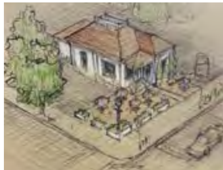
Historic Moullet House Landscape Restoration Read More...