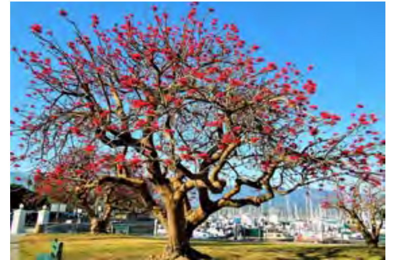
Most popular on Edhat.com: Naked Coral Tree (Erythrina coralloides) Read More...