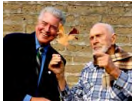
"In Their Own Words" – SBB Past Presidents' Oral History Project - Volume I Read More... NEW to our website – Behind the Scenes Personal Stories!