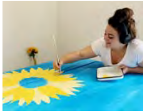
Pianos On State Read More...