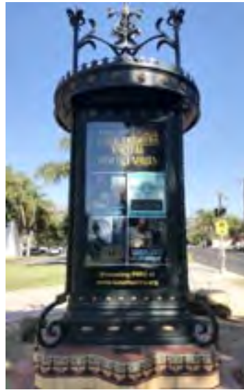
Marjorie Luke Theater Kiosk Restoration Read More...