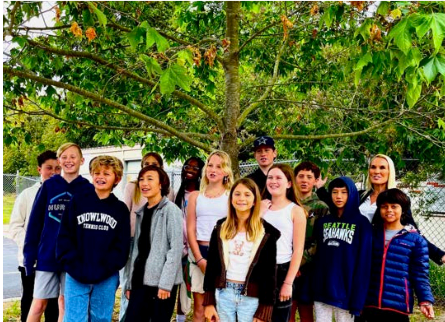
Cold Spring School 6th Grade Class returns to their "full grown" Kindergarten tree named "Fred"