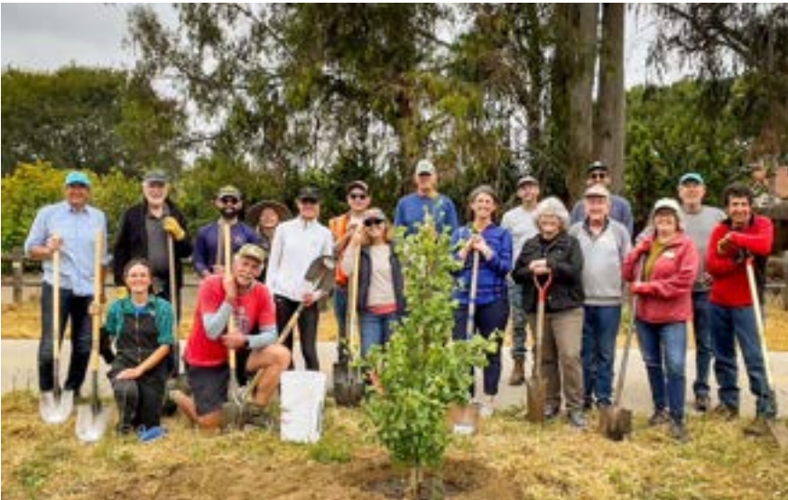
2024 Obern Trail Gingko Tree Planting by volunteers from CycleMAYnia and SBB board members