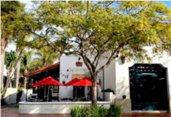
“A Tribute from Claire” commemorative tree plaque location

Honor a special someone or a special occasion with an attractive commemorative plaque that will be installed at the base of an existing street tree – located in the parkway between the sidewalk & the street – within the City of Santa Barbara. Santa Barbara Beautiful has participated in the planting of over 14,000 street trees, so there are plenty of trees from which to choose! Your Application Fee includes a Free 1-Year Membership.