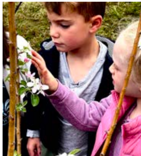
Kindergarten Class plants an apple tree named "Appley" at Cold Spring School