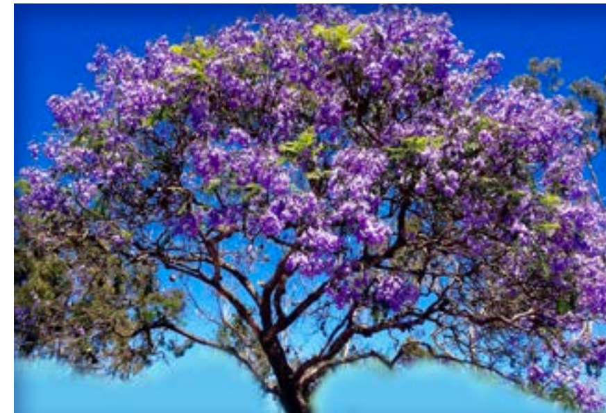
Jacaranda Tree, one of the two Official City Trees of Santa Barbara