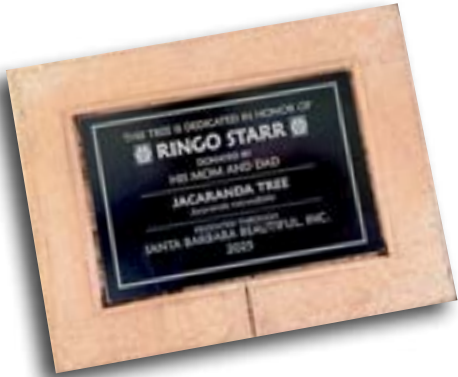
Commemorative Tree Plaque dedicated to the family puppy, “Ringo Starr”

I know this will be a very special tree for our family and I hope that it will feel a little bit like he is still there with us. The grief has been insurmountable.”